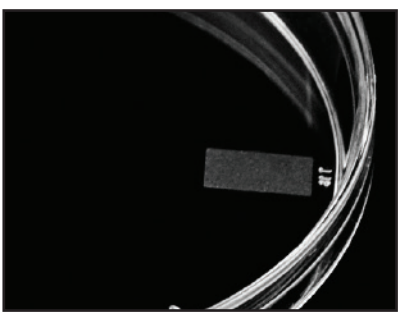
ISO Mark Target for orientation in automated filling and streaking equipment